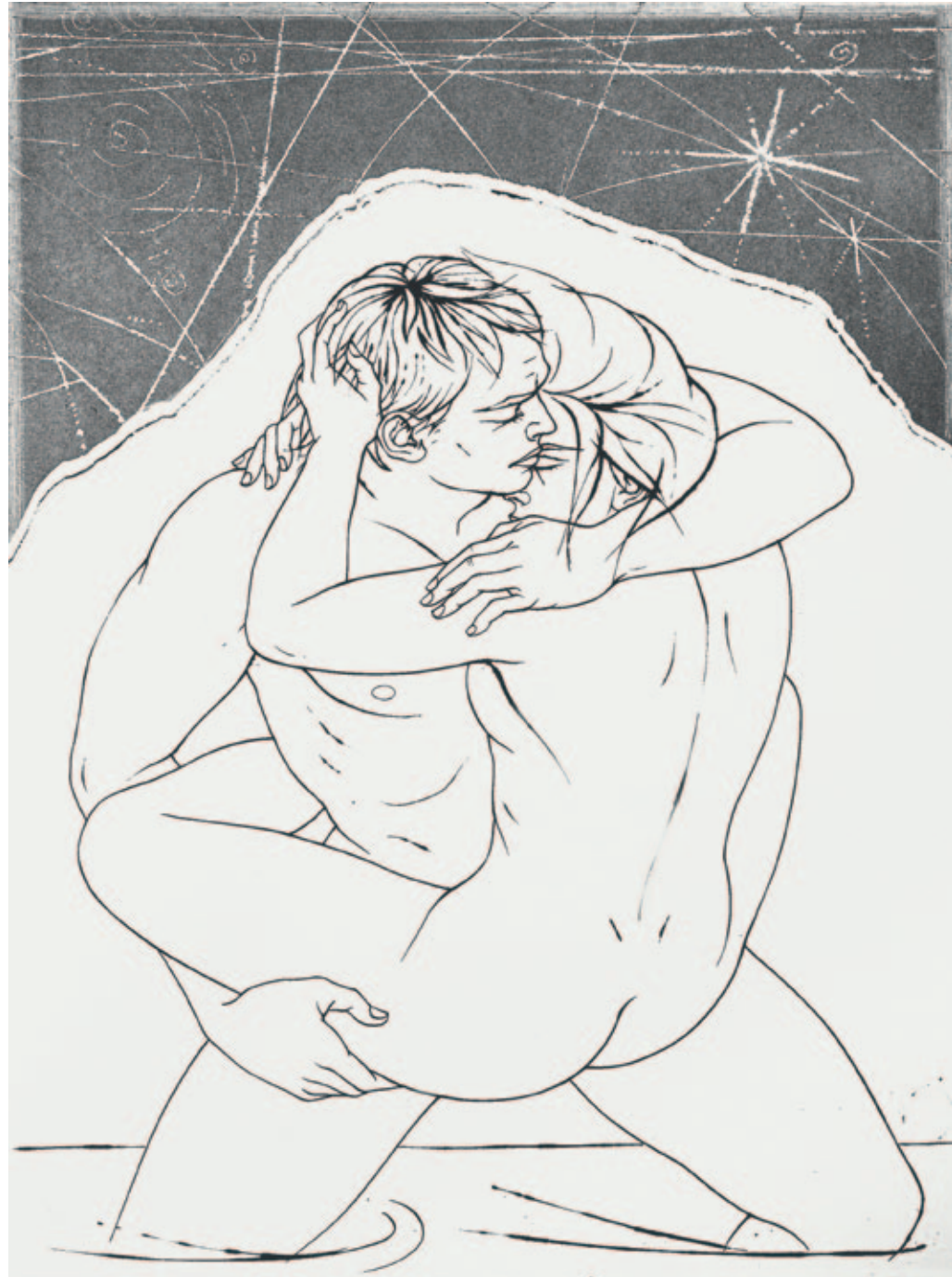
Trémois, Mythologies, burin, 1970